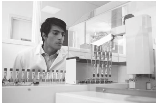
Testing samples in laboratories